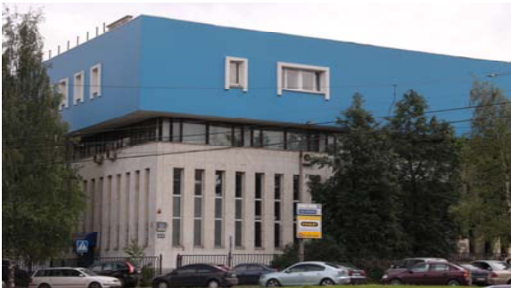
Moscow 119526, 101 (1) prospect Vernadskogo

Conference venue is Ishlinsky Institute for Problems in Mechanics of the RAS (IPMech RAS)